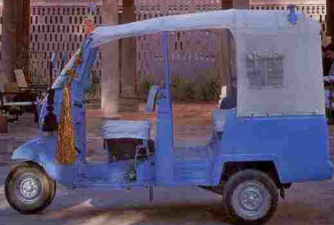
The Jodhpur-blue tuk-tuk awaits you near the entrance at Raas, in Jodhpur.